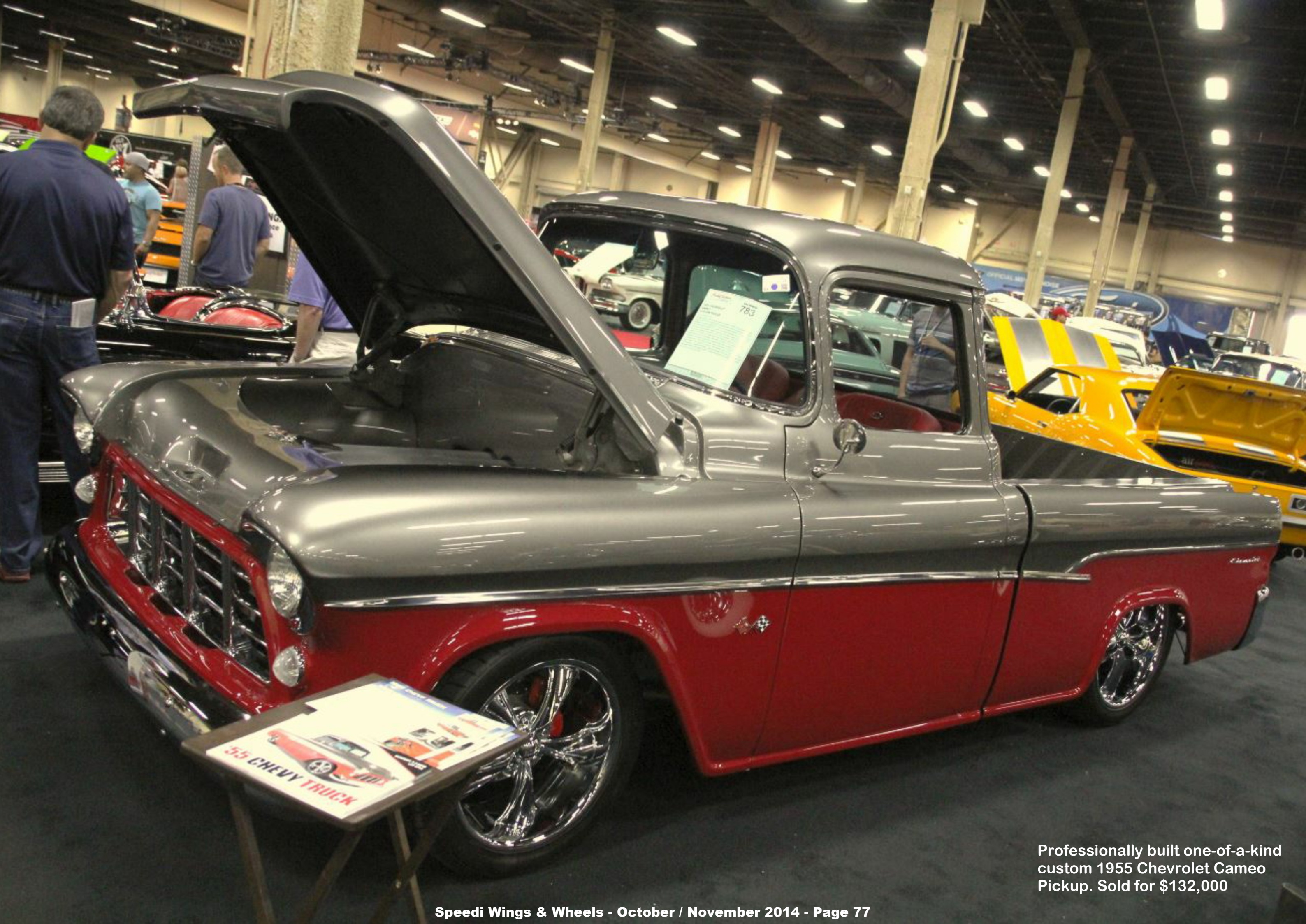
Professionally built one-of-a-kind custom 1955 Chevrolet Cameo Pickup. Sold for $132,000