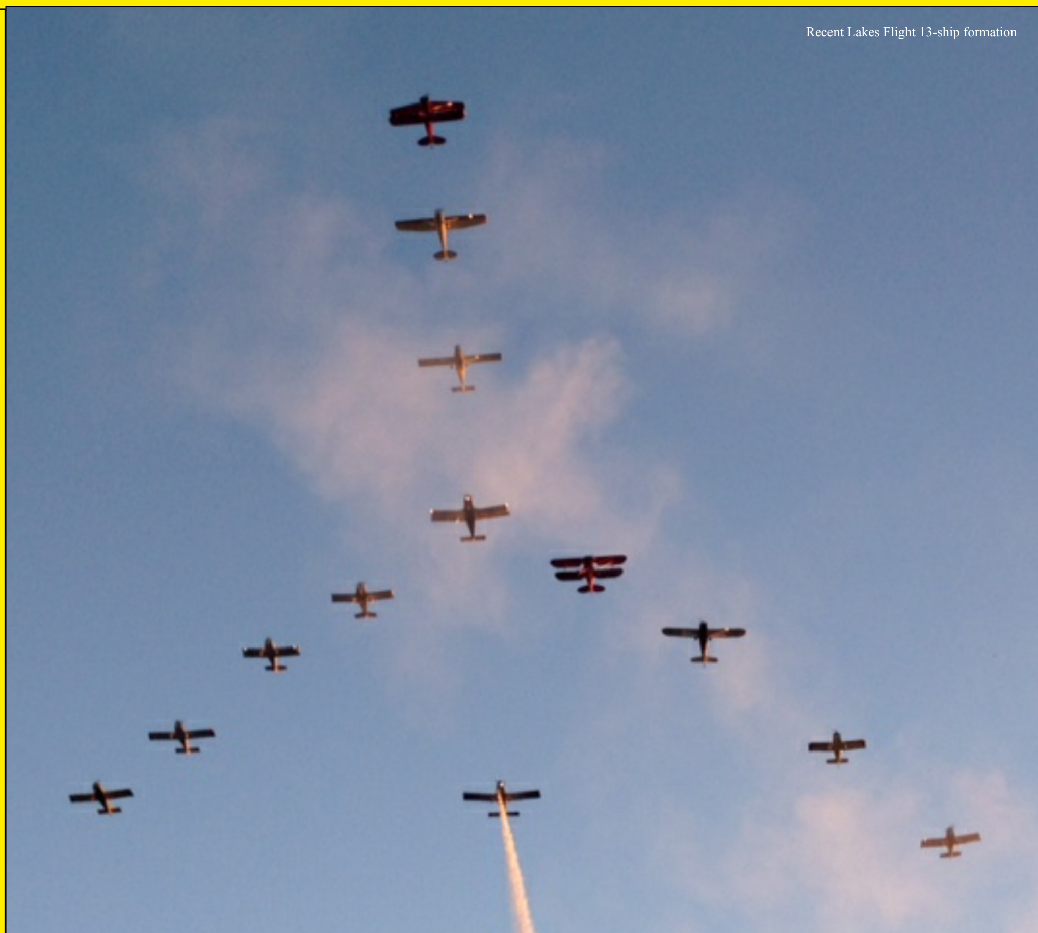
Recent Lakes Flight 13-ship formation