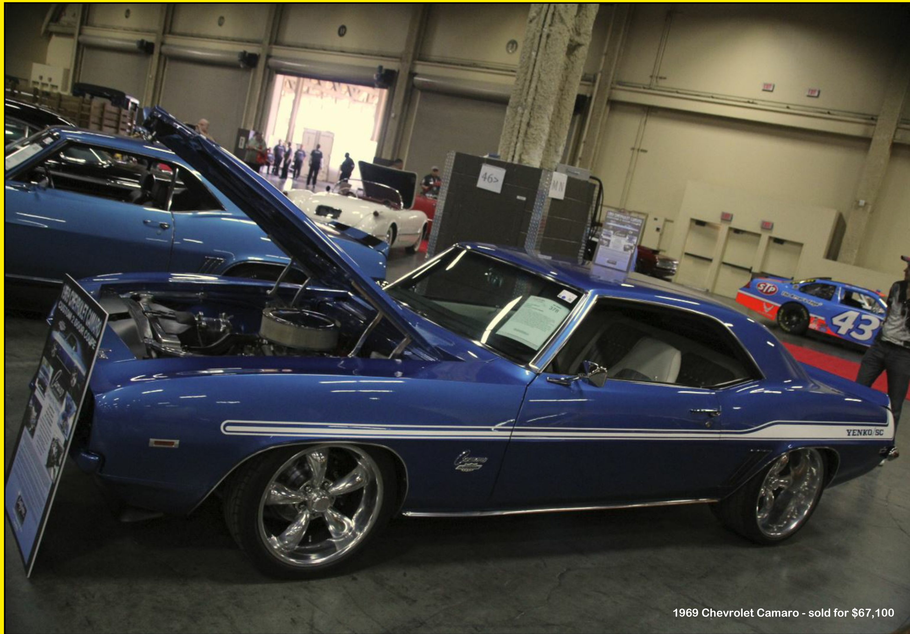
1969 Chevrolet Camaro - sold for $67,100