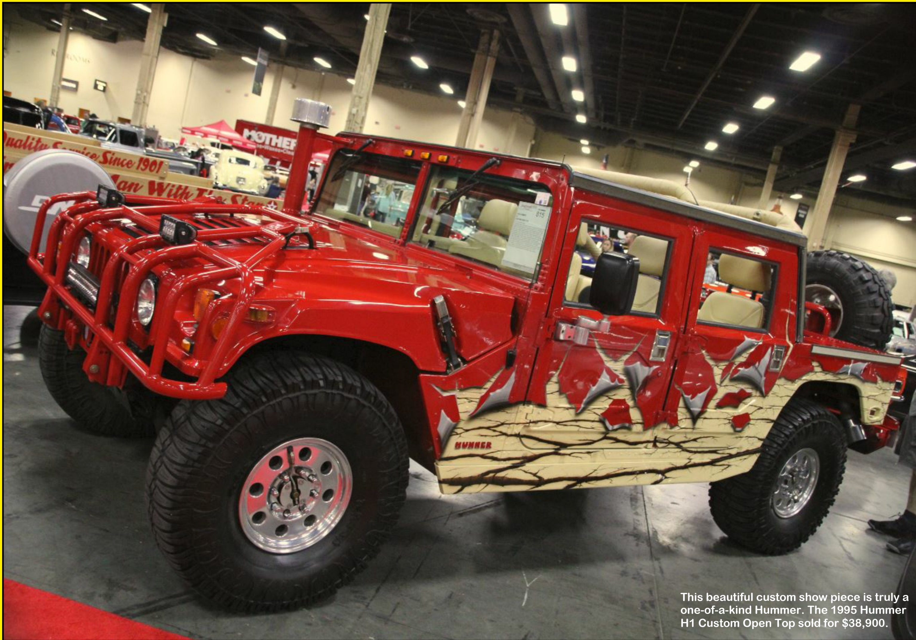
This beautiful custom show piece is truly a one-of-a-kind Hummer. The 1995 Hummer H1 Custom Open Top sold for $38,900.