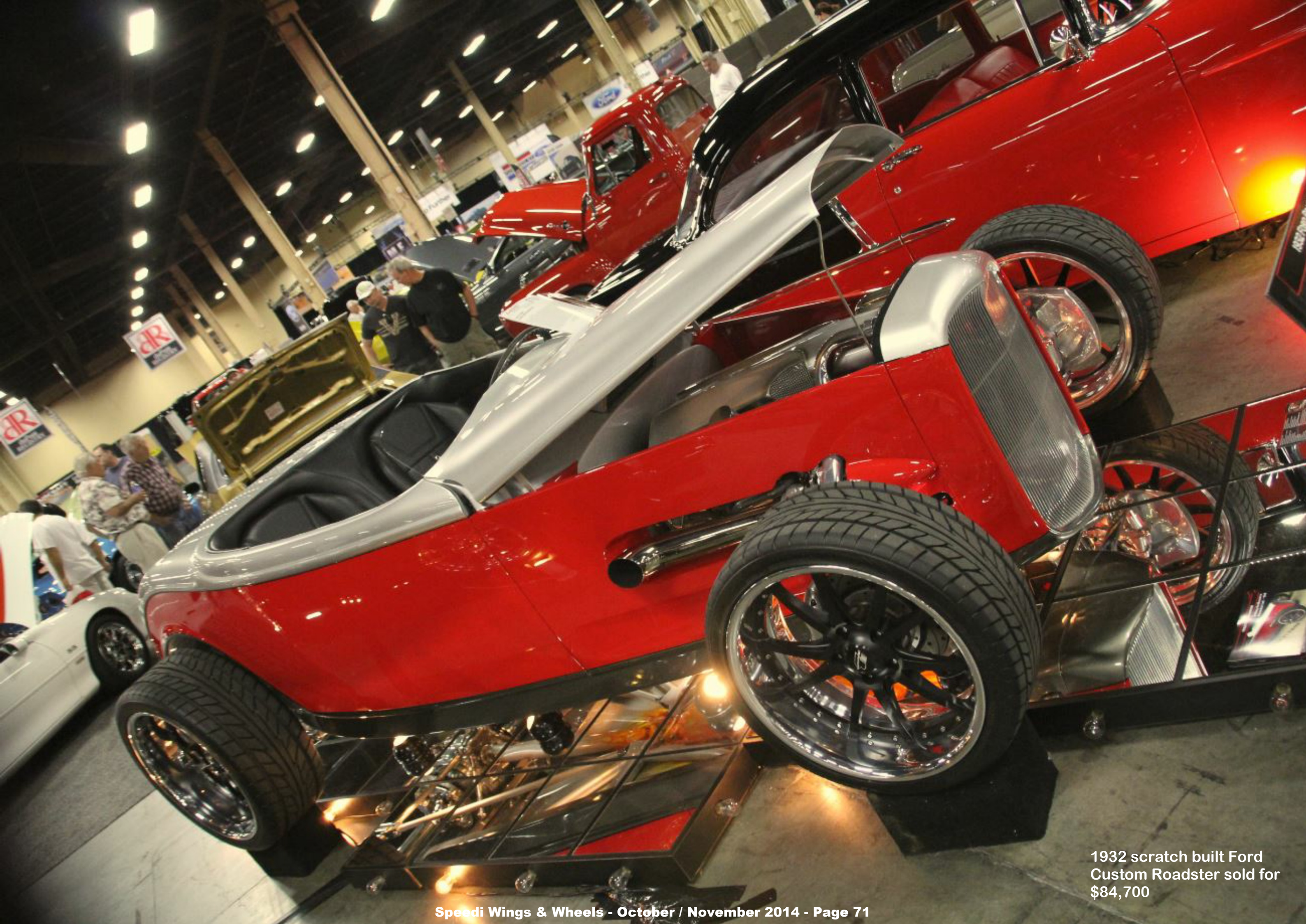
1932 scratch built Ford Custom Roadster sold for $84,700