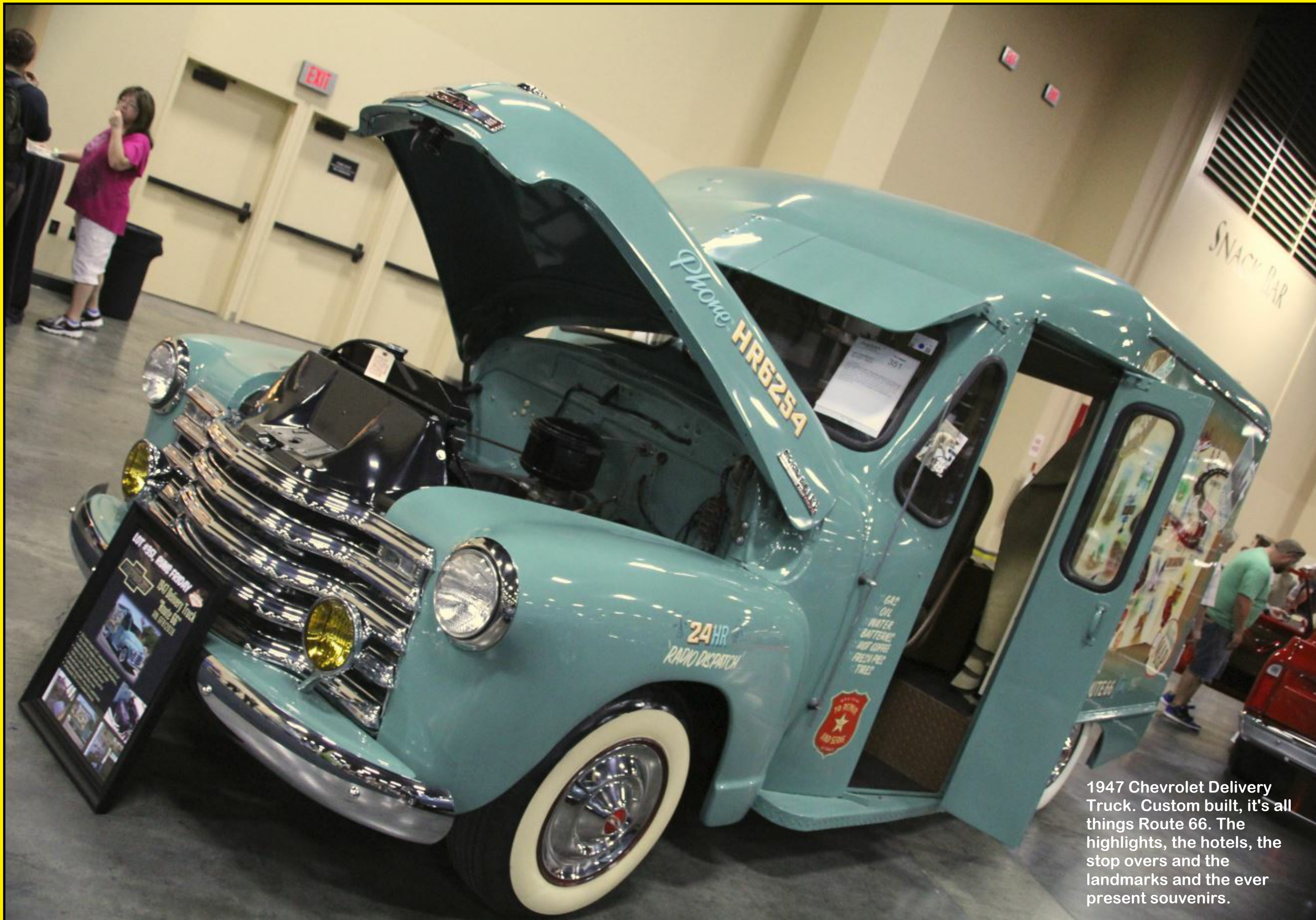
1947 Chevrolet Delivery Truck. Custom built, it's all things Route 66. The highlights, the hotels, the stop overs and the landmarks and the ever present souvenirs.