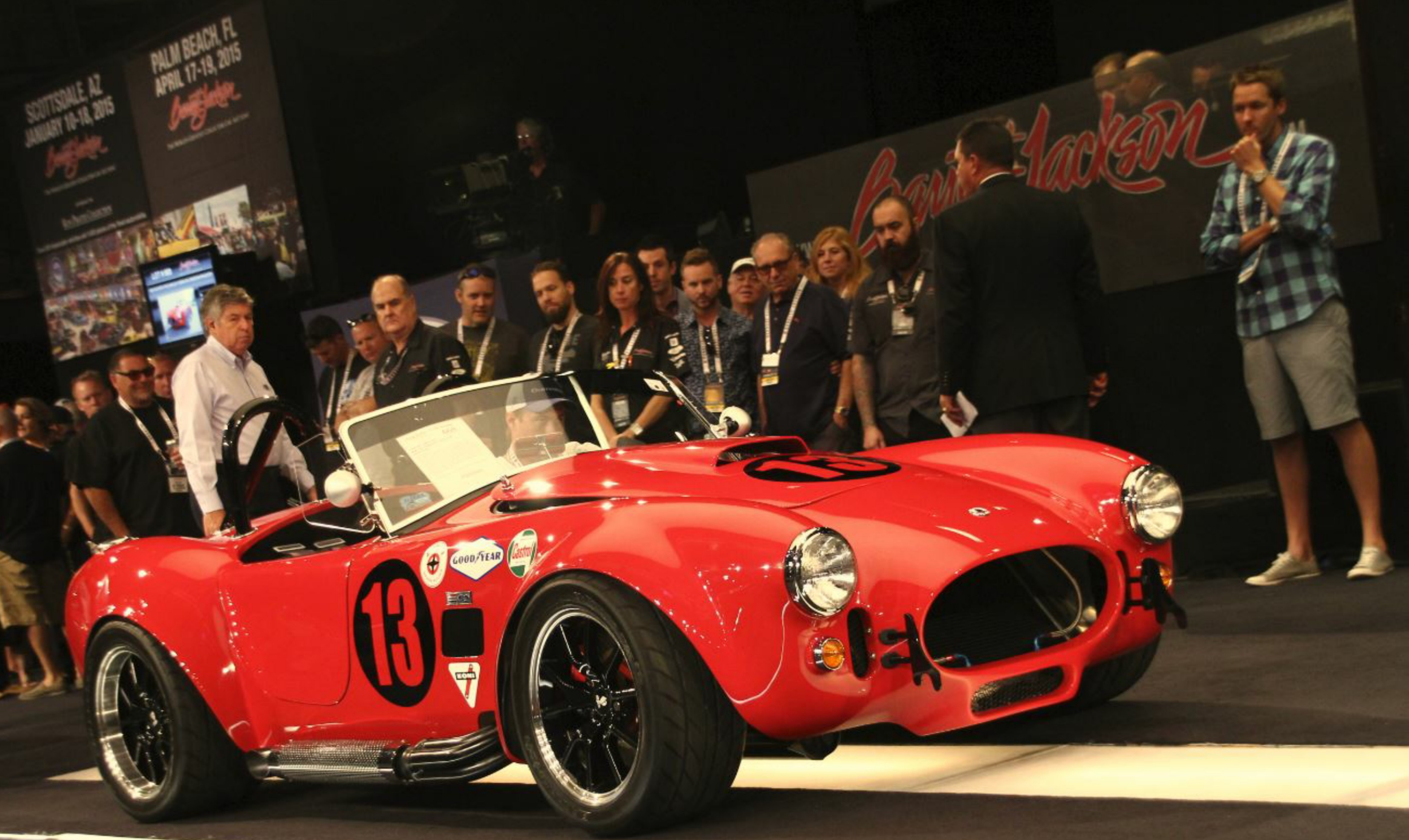
This 1965 Factory Five Racing Cobra re-creation was recently finished and was a no-expense spared build sold for $40,700