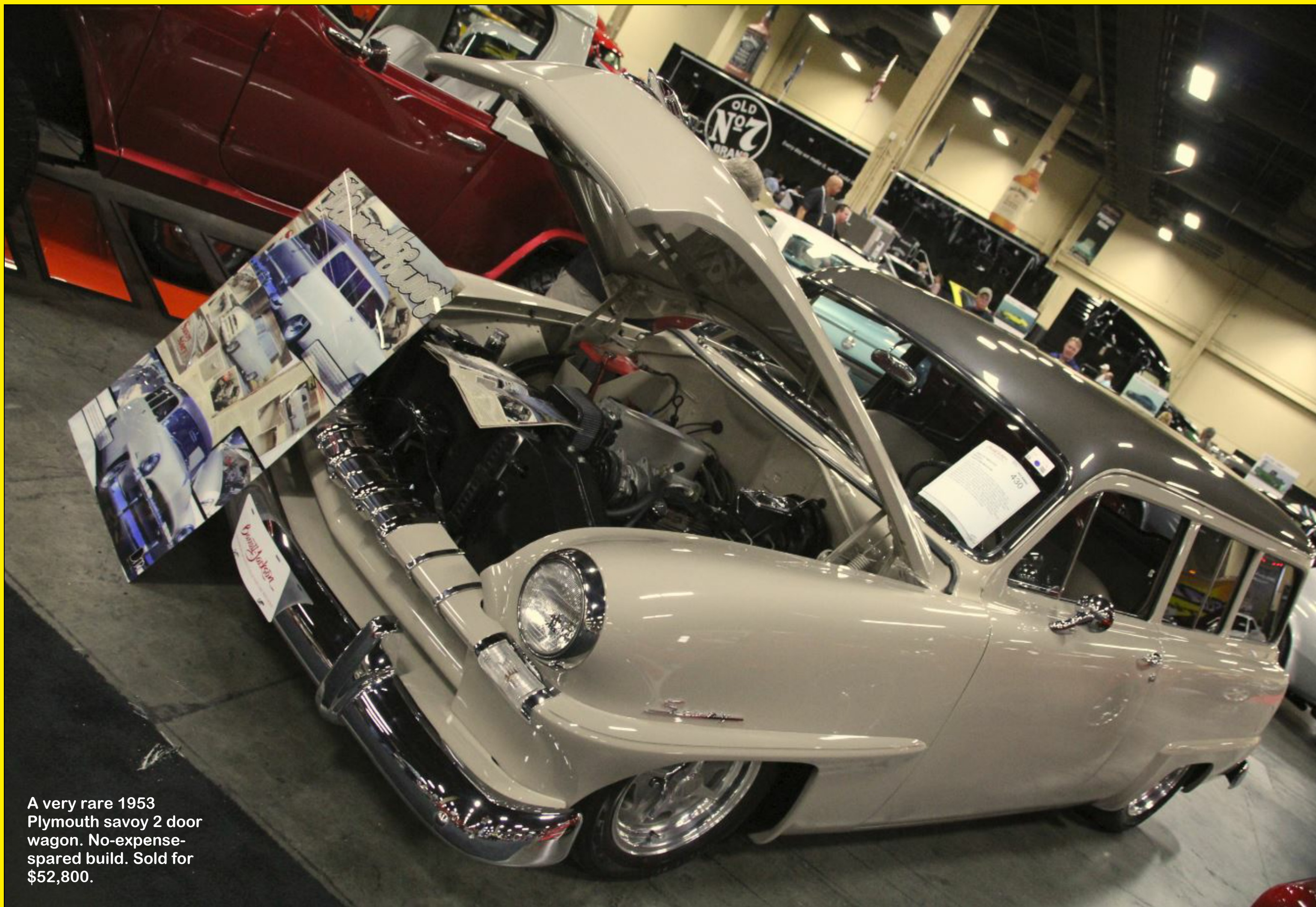
A very rare 1953 Plymouth savoy 2 door wagon. No-expense- spared build. Sold for $52,800.