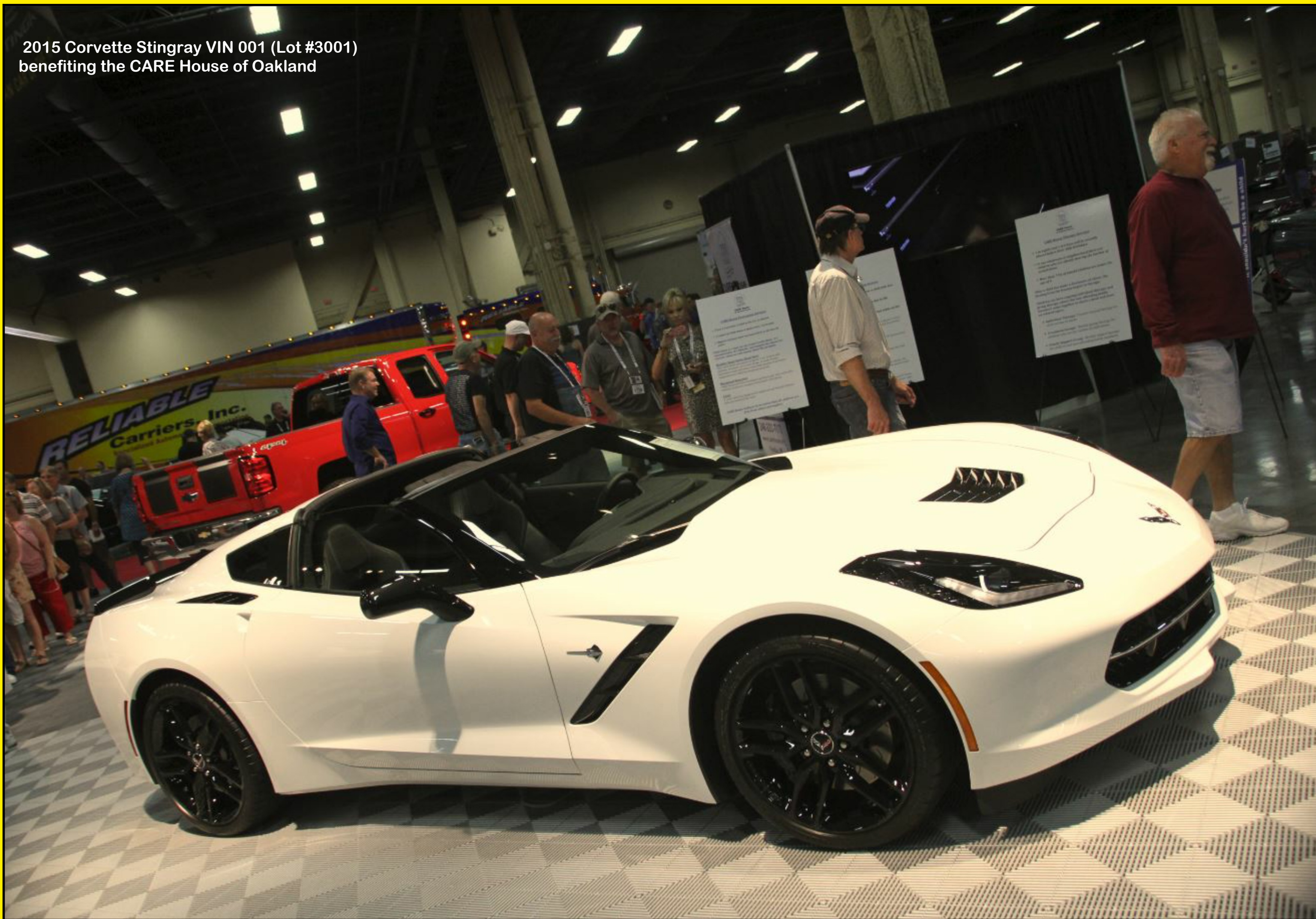
2015 Corvette Stingray VIN 001 (Lot #3001) benefiting the CARE House of Oakland