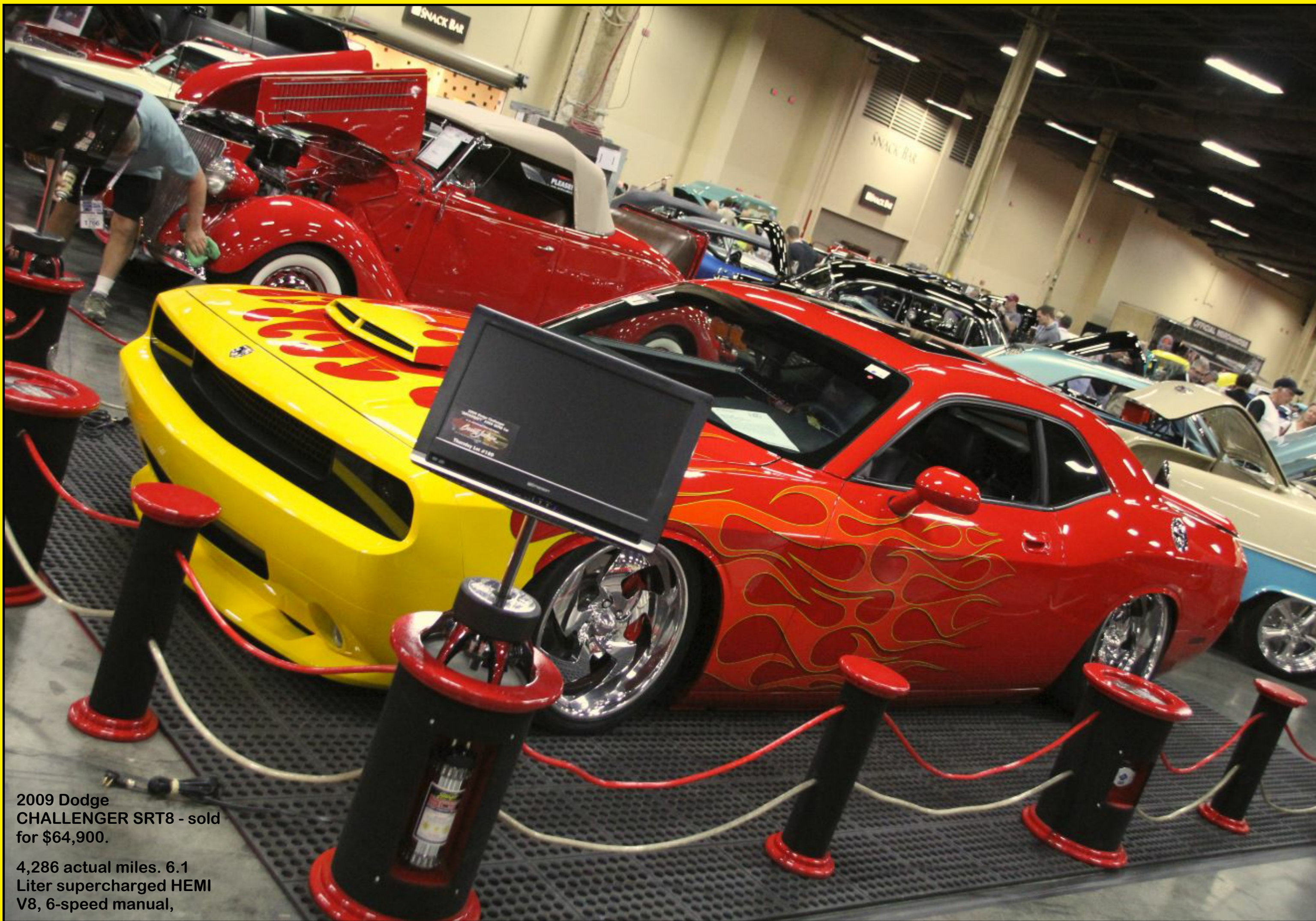
2009 Dodge CHALLENGER SRT8 - sold for $64,900.

4,286 actual miles. 6.1 Liter supercharged HEMI V8, 6-speed manual,