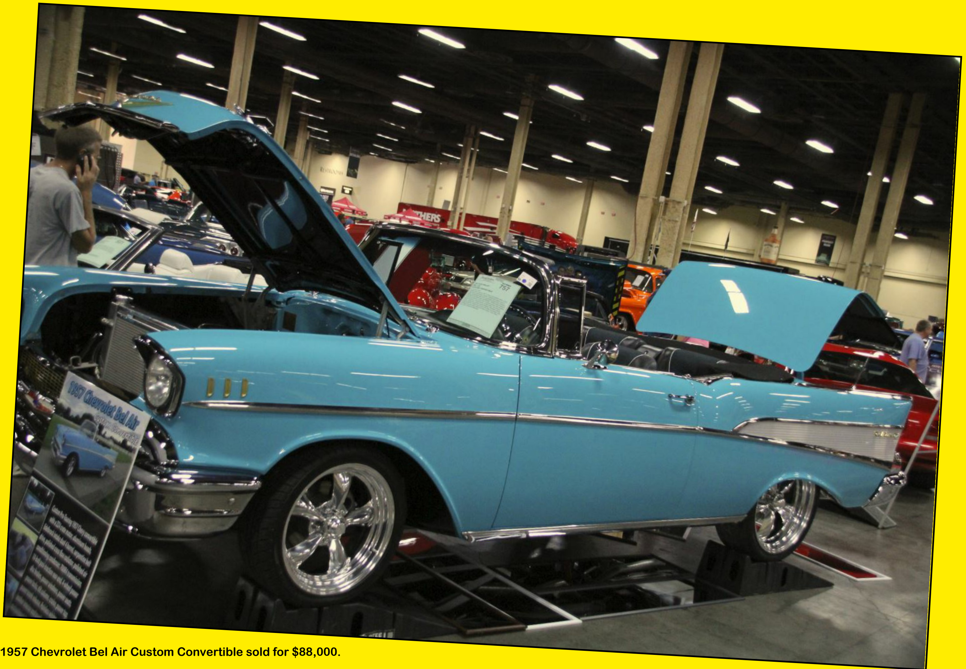
1957 Chevrolet Bel Air Custom Convertible sold for $88,000.