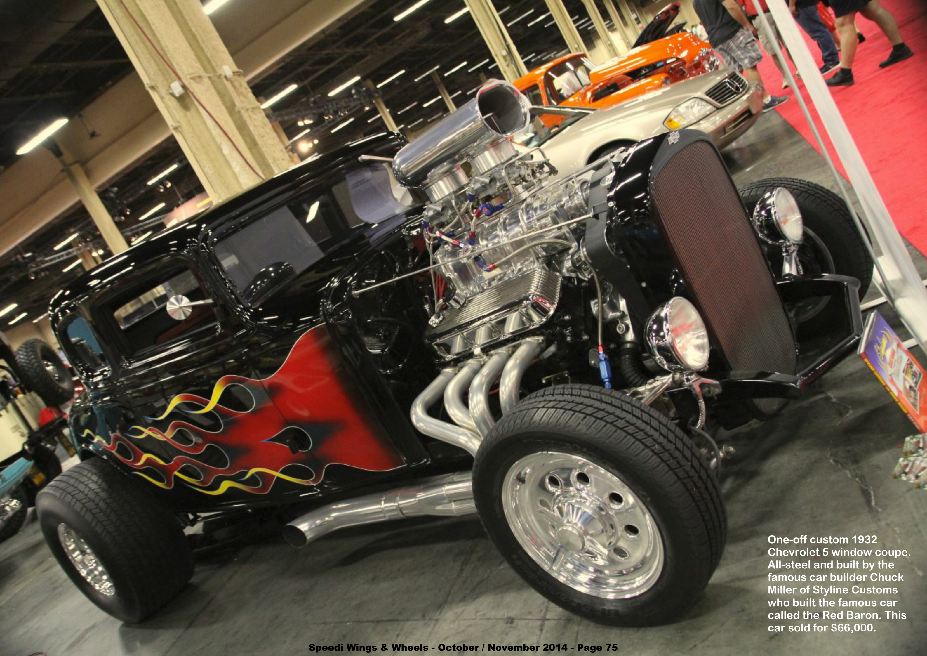
One-off custom 1932 Chevrolet 5 window coupe. All-steel and built by the famous car builder Chuck Miller of Styline Customs who built the famous car called the Red Baron. This car sold for $66,000.