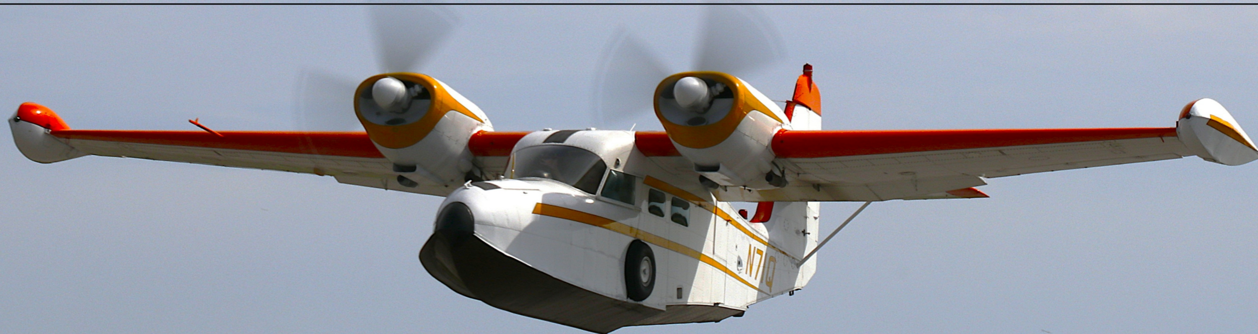
Here's a look at the planes at Spruce Creek Fly-in on a Saturday in May 2026.