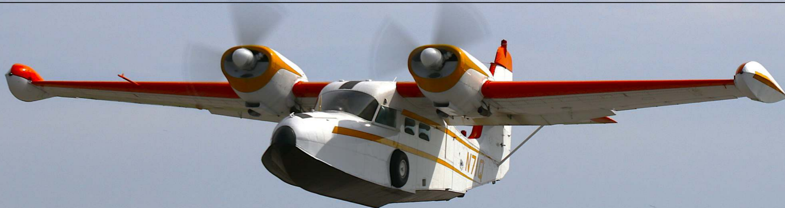
Here's a look at the planes at Spruce Creek Fly-in on a Saturday in May 2026.