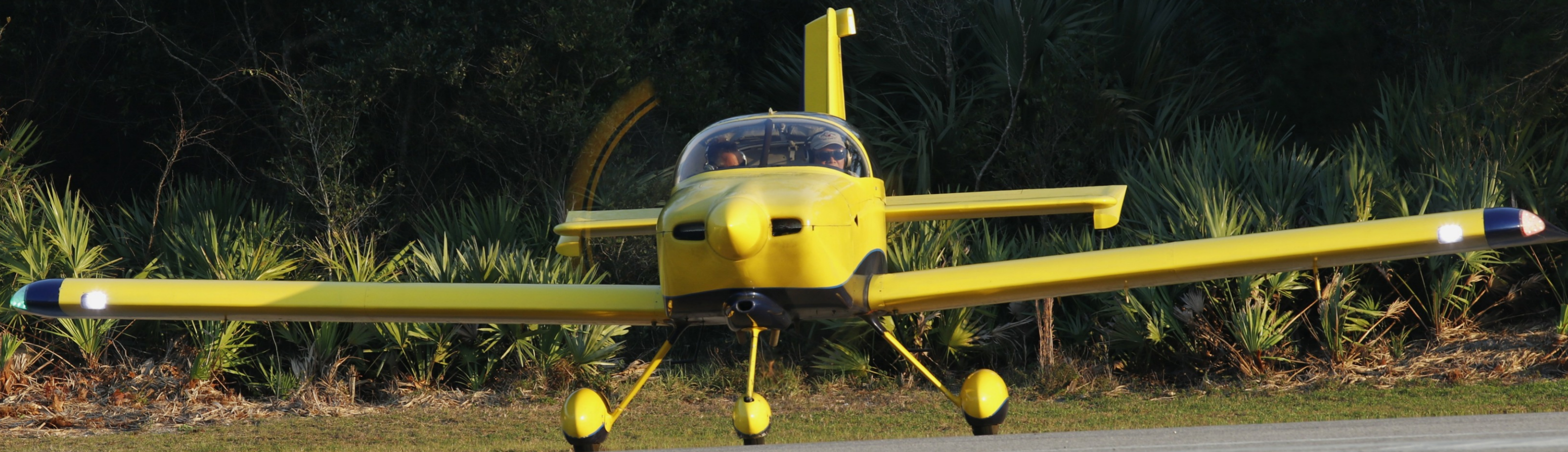
Here's a look at the planes at Spruce Creek Fly-in on a Friday evening in February 2024