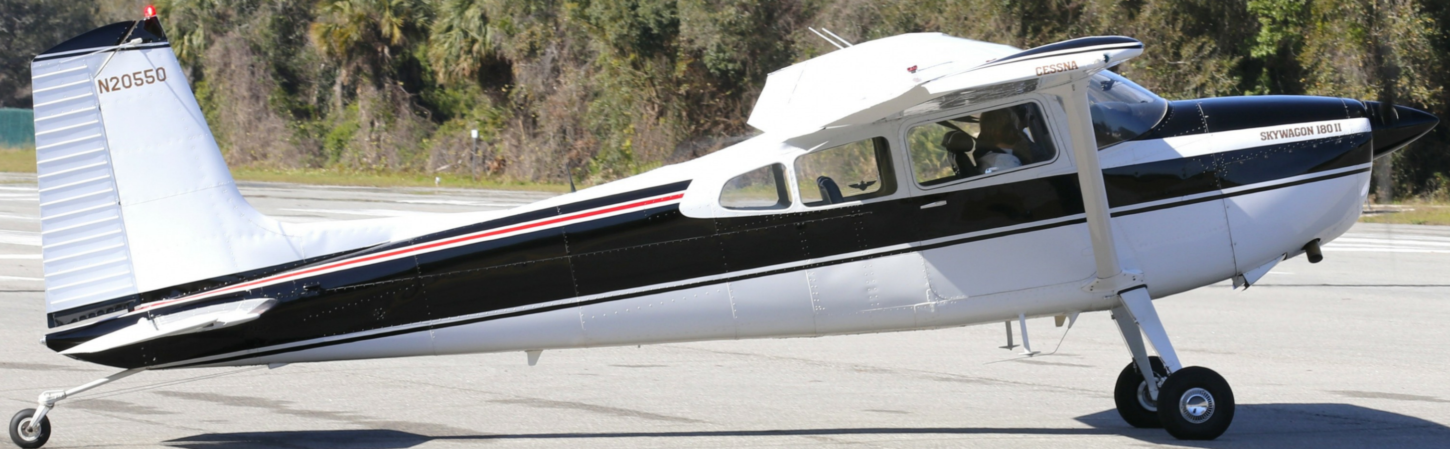
Planes at Spruce Creek Fly-in on a Saturday morning in February 2024